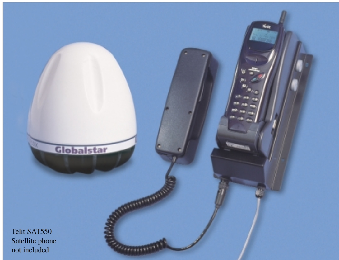
Telit SAT550 Satellite phone not included

High quality cellular style communication, even out of sight of land. The SAT550X Marine Terminal offers Dual Mode, Satellite and GSM 900 communications to all sea-going vessels and is also suitable for many applications on land.